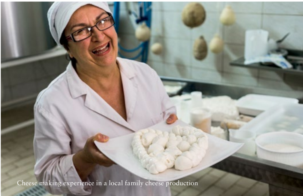
Cheese making experience in a local family cheese production