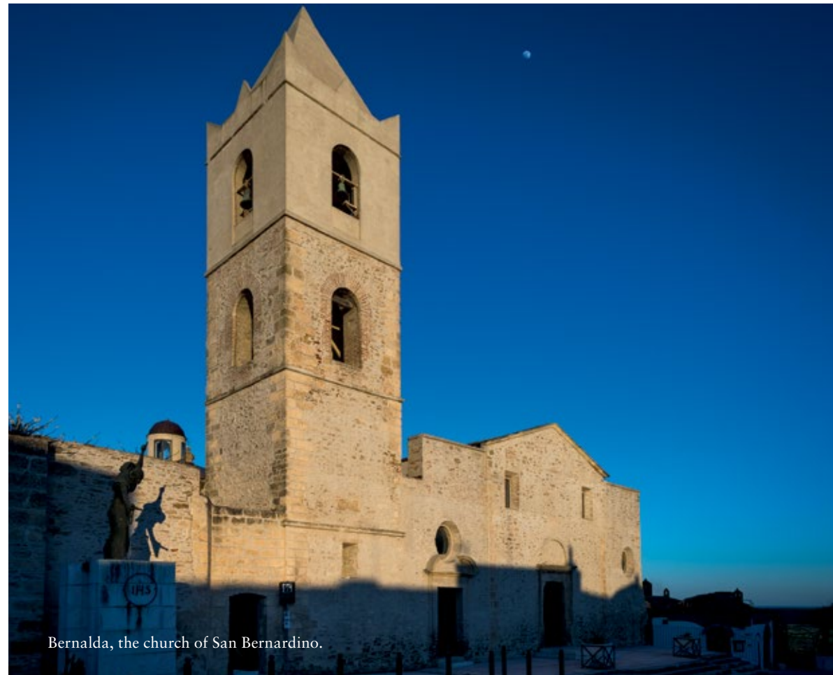
Bernalda, the church of San Bernardino.