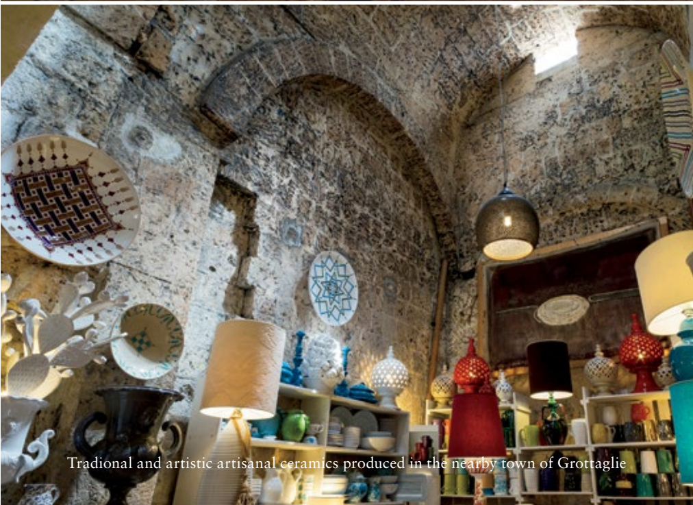
Traditional and artistic artisanal ceramics produced in the nearby town of Grottaglie