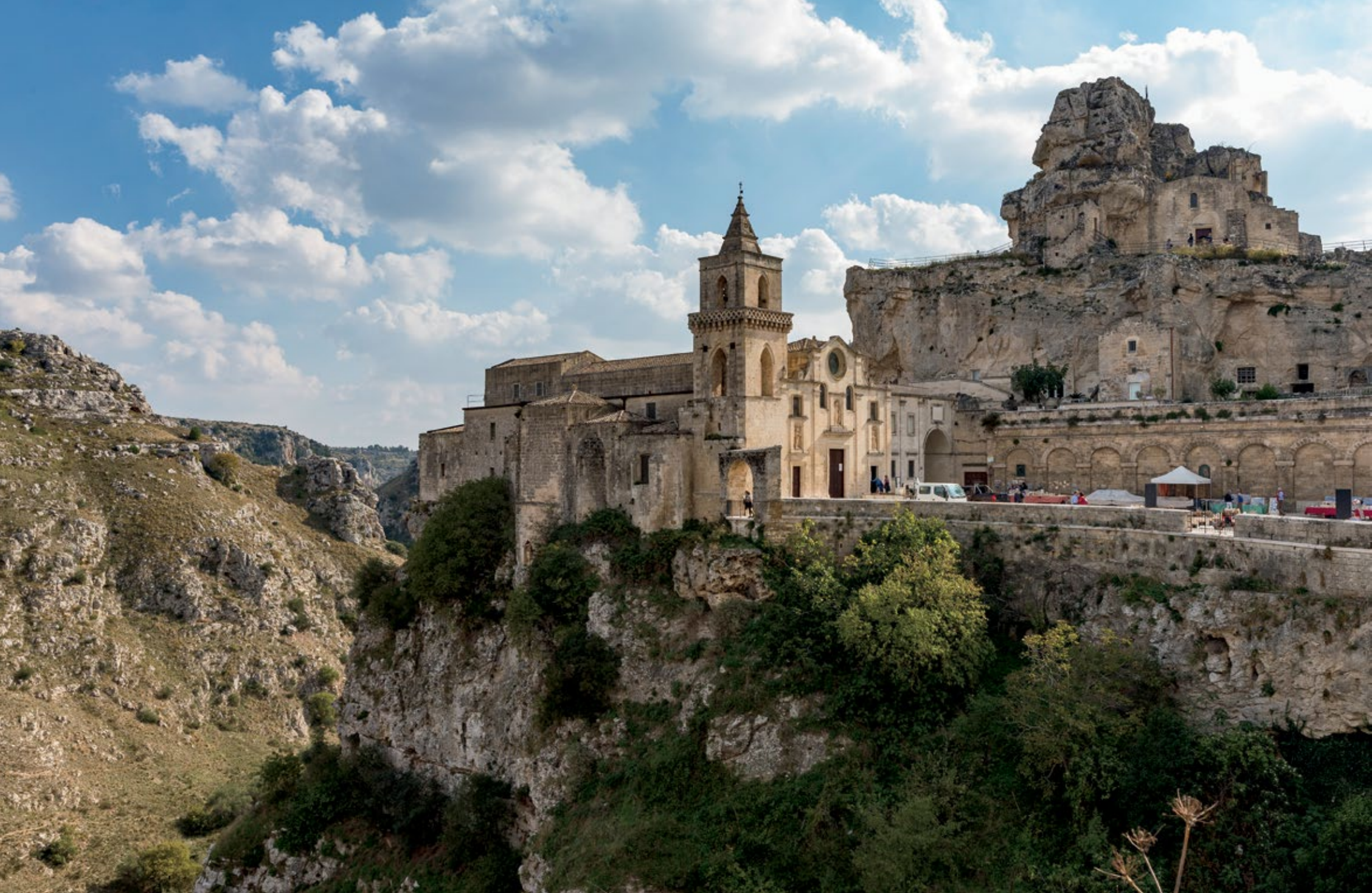
Matera, a UNESCO World Heritage Site. The ancient cave dwellings, known as “Sassi,” have been continuously inhabited since Paleolithic times.