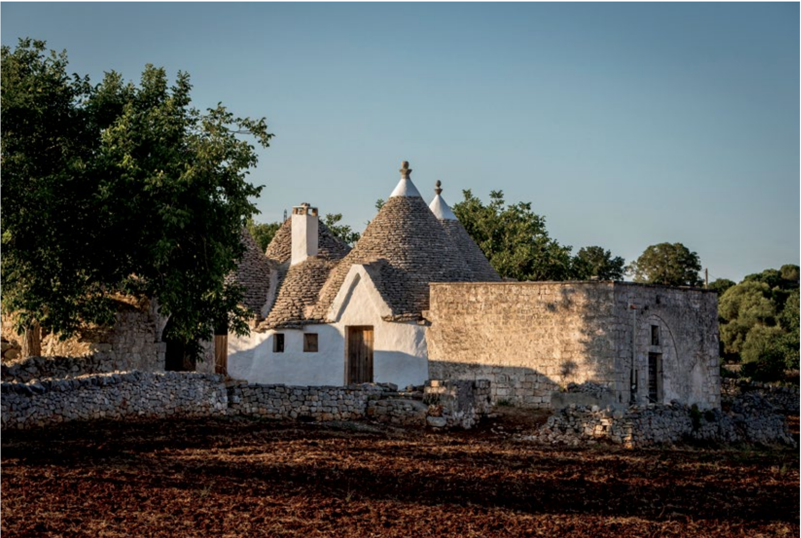
Valle D'Itria, a UNESCO World Heritage Site. The traditional and enchanting stone huts with conical roofs are known as "Trulli."