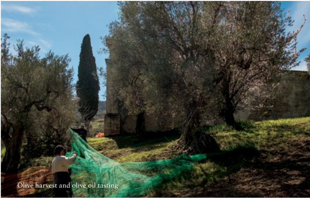
Olive harvest and olive oil tasting