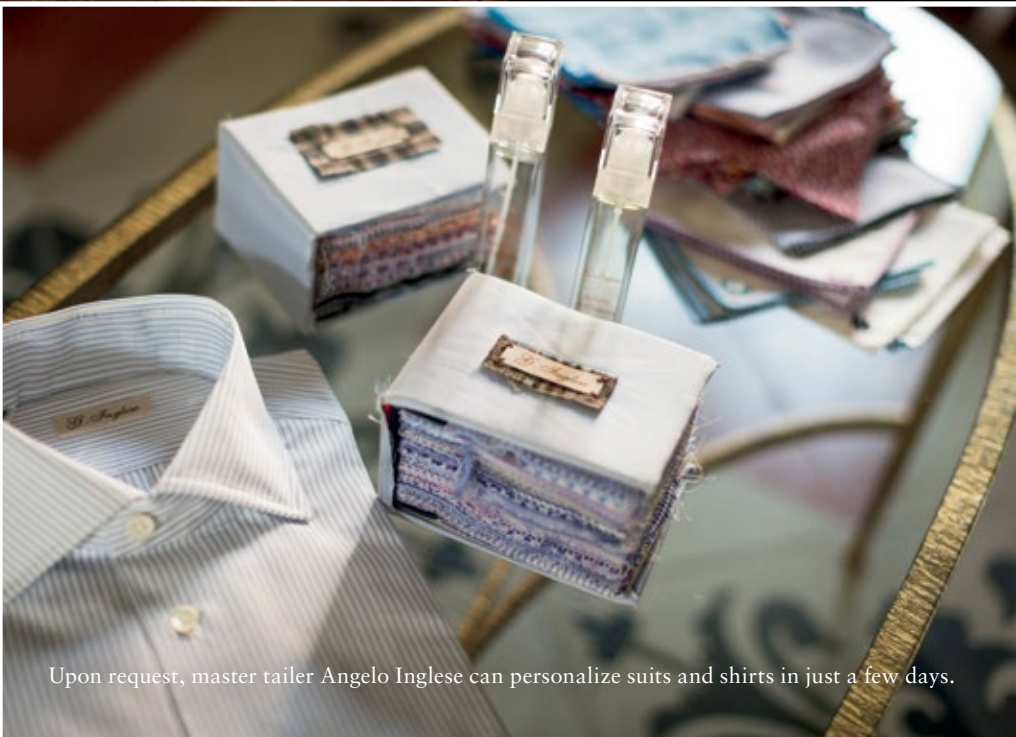
Upon request, master tailor Angelo Inglese can personalize suits and shirts in just a few days.