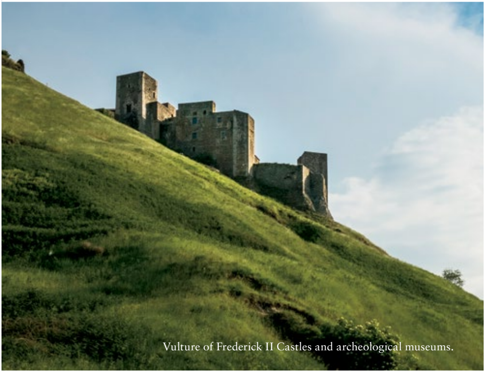
Vulture of Frederick II Castles and archeological museums.