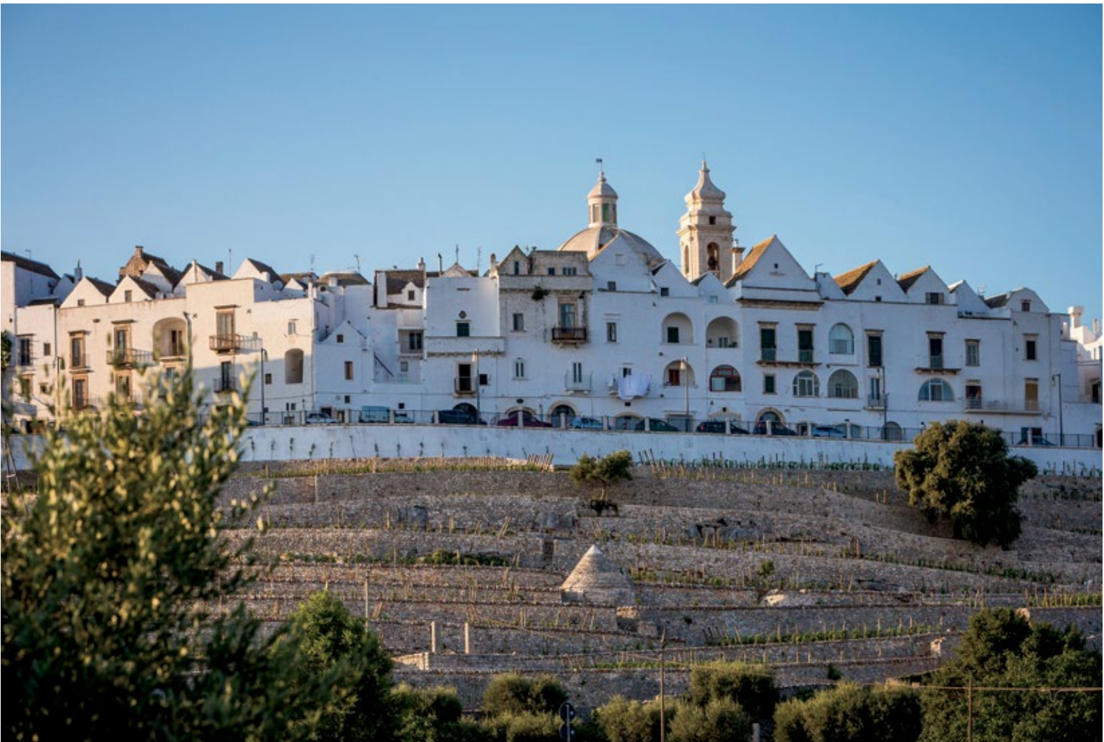
Locorotondo is built on a circular plan. The beauty of the historical center is represented by its labyrinth of white alleys.