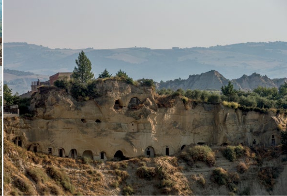
Aliano is located on a clay spur in the Calanchi (Badlands) landscape. In this magical place you can visit Carlo Levi's house, a writer and painter who was exiled here during the fascist period. Today Aliano is a Literary Park where many activities take place all year round.