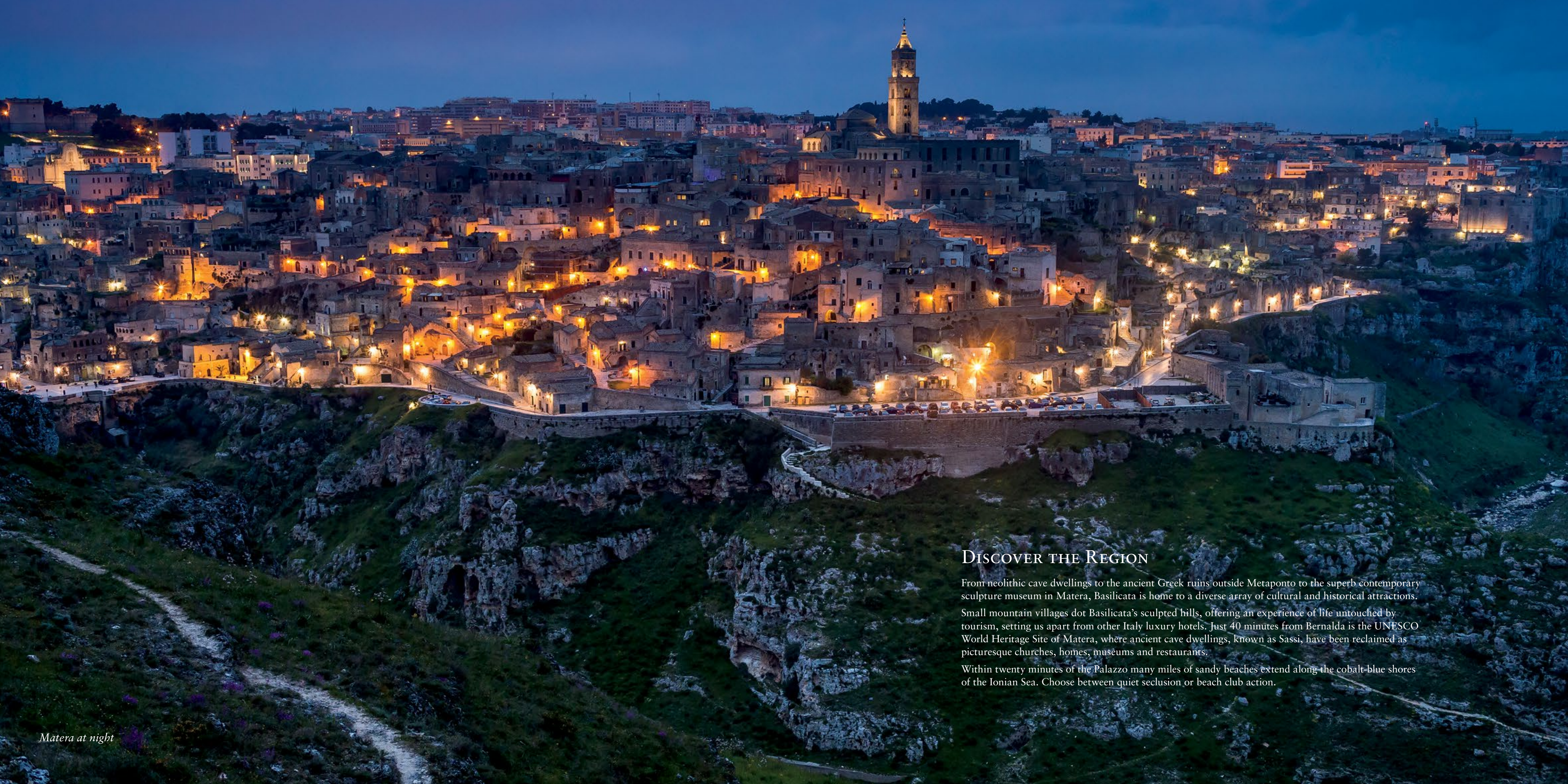
Matera at night