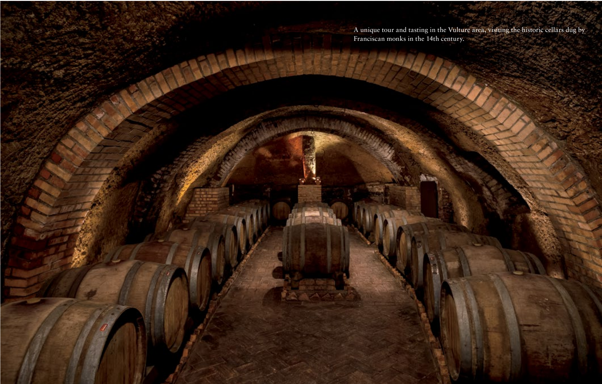
A unique tour and tasting in the Vulture area, visiting the historic cellars dug by Franciscan monks in the 14th century.