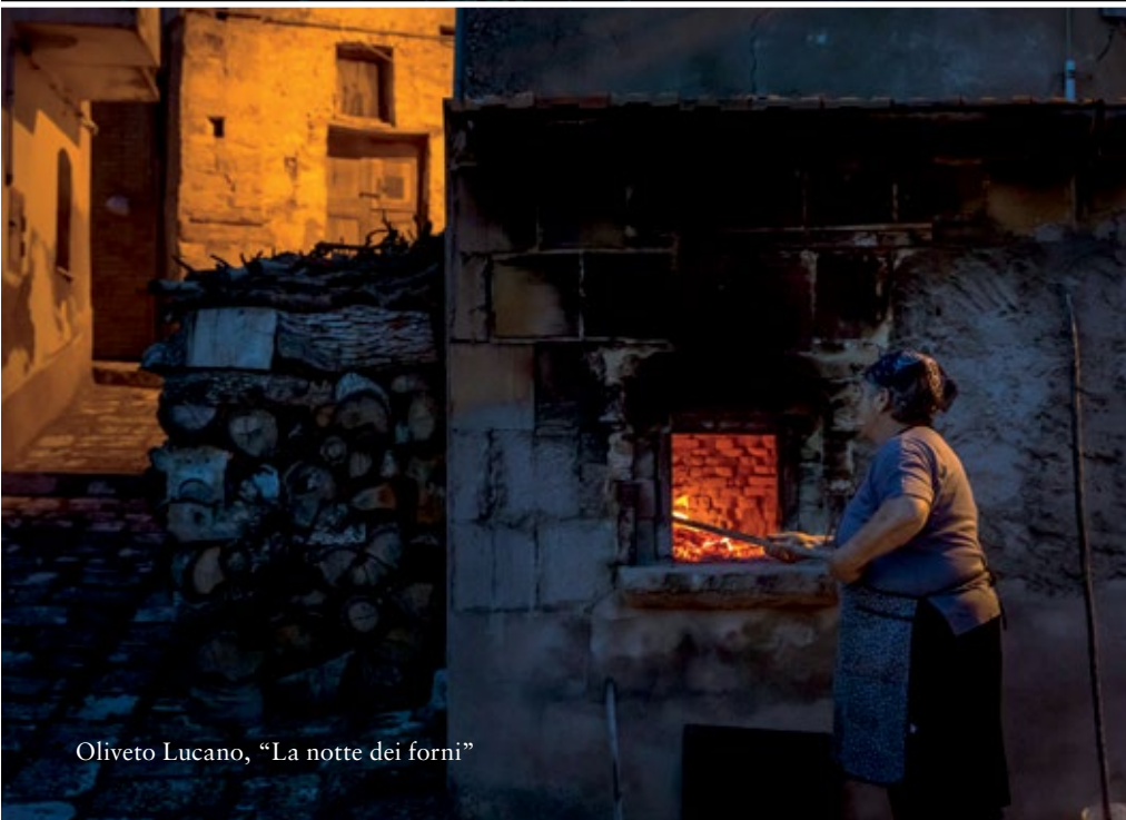
Oliveto Lucano, "La notte dei forni"