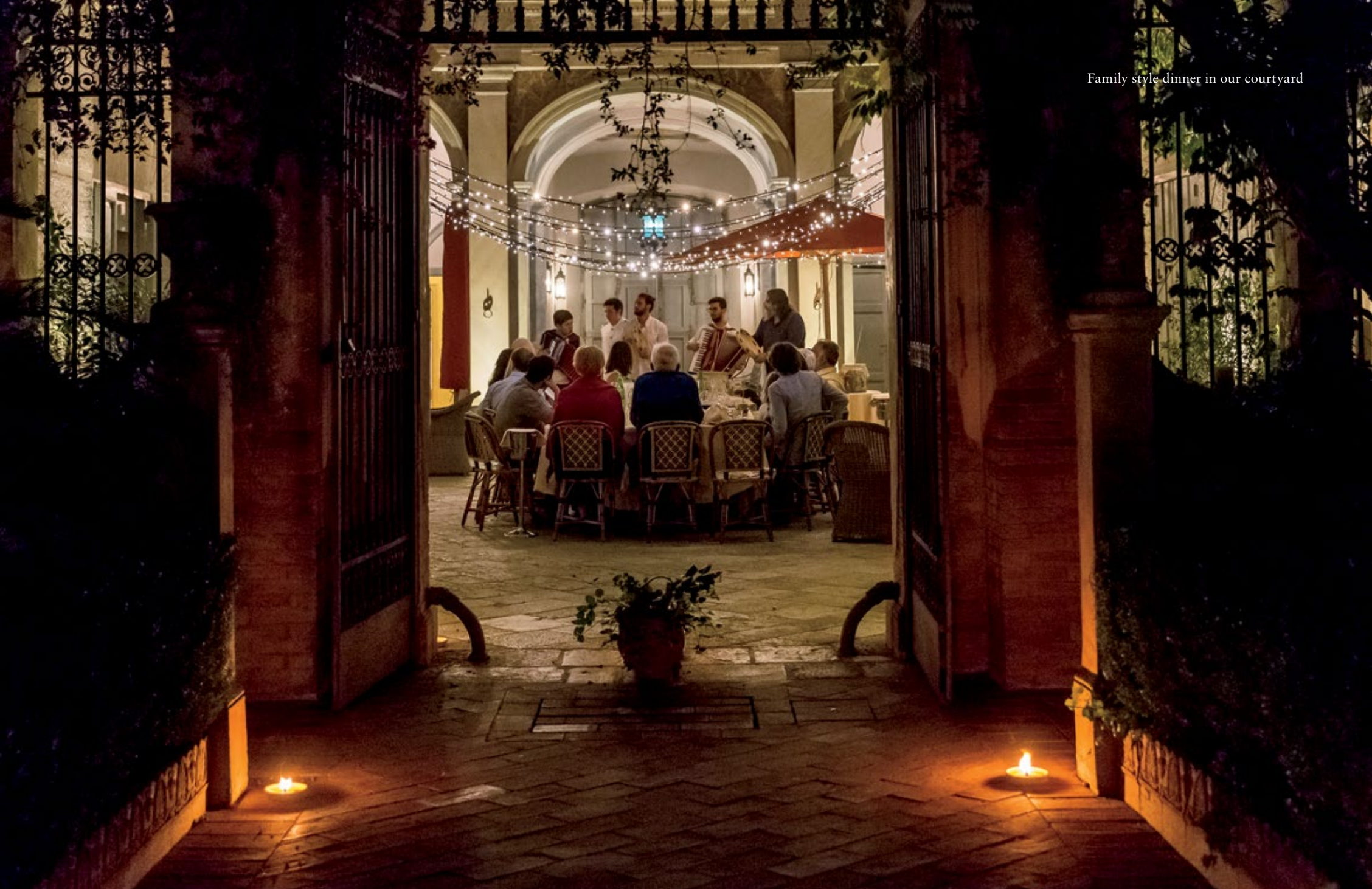
Family style dinner in our courtyard