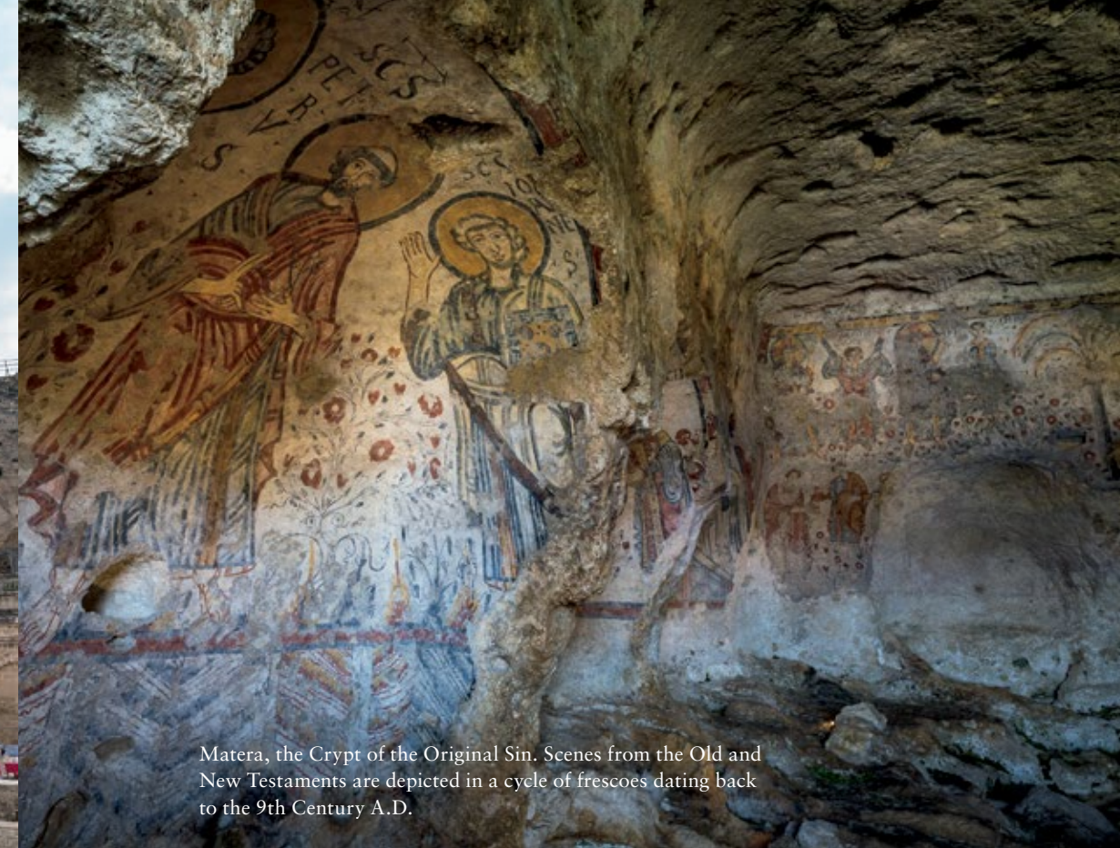
Matera, the Crypt of the Original Sin. Scenes from the Old and New Testaments are depicted in a cycle of frescoes dating back to the 9th Century A.D.