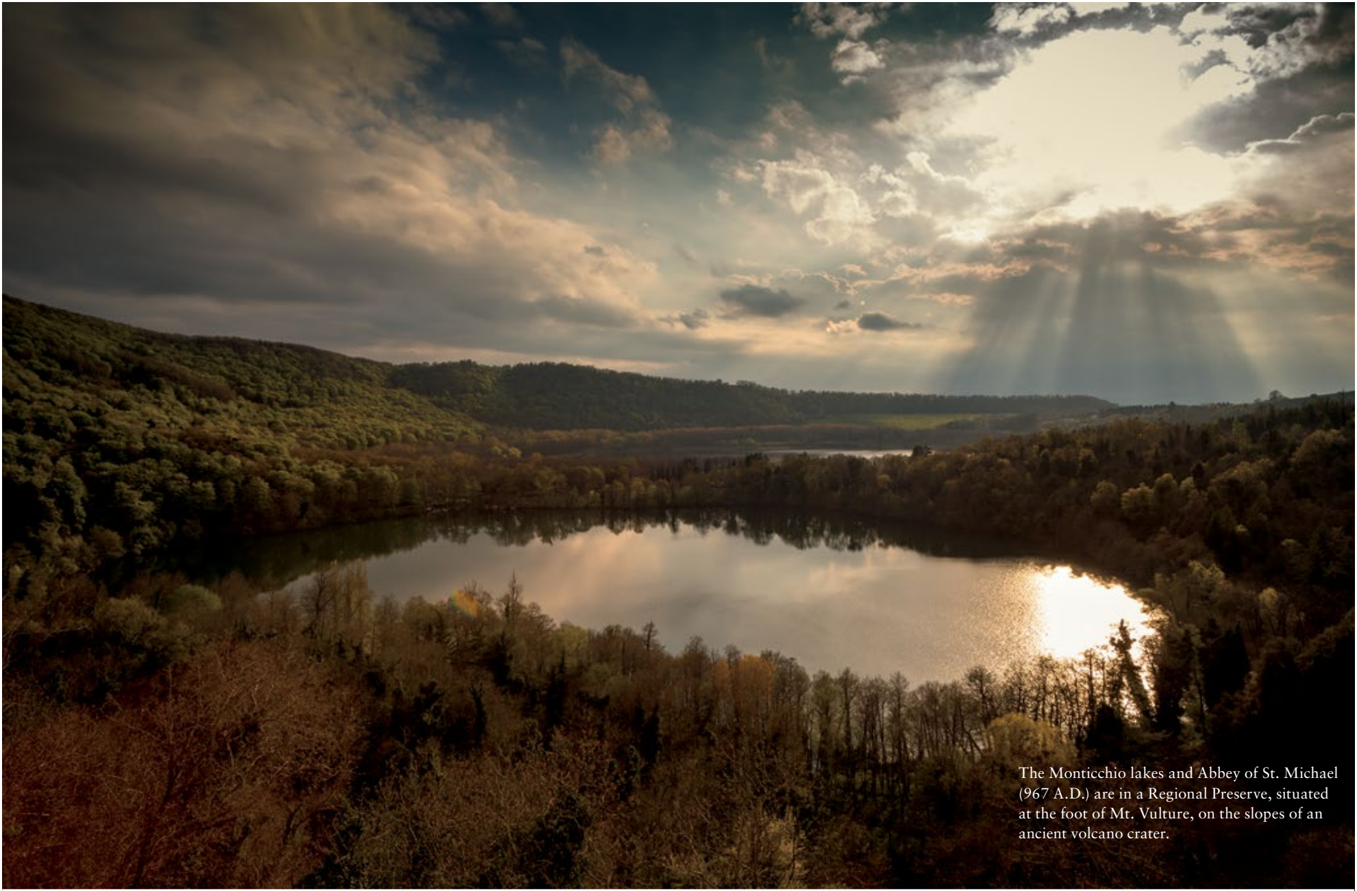
The Monticchio lakes and Abbey of St. Michael (967 A.D.) are in a Regional Preserve, situated at the foot of Mt. Vulture, on the slopes of an ancient volcano crater.