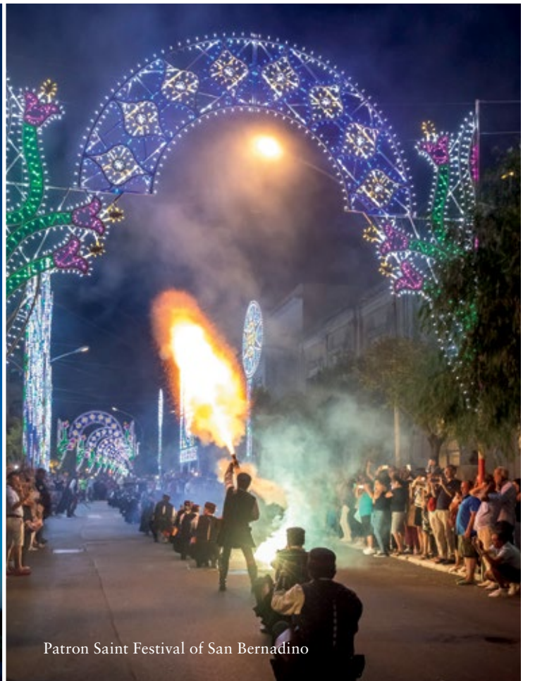
Patron Saint Festival of San Bernardino