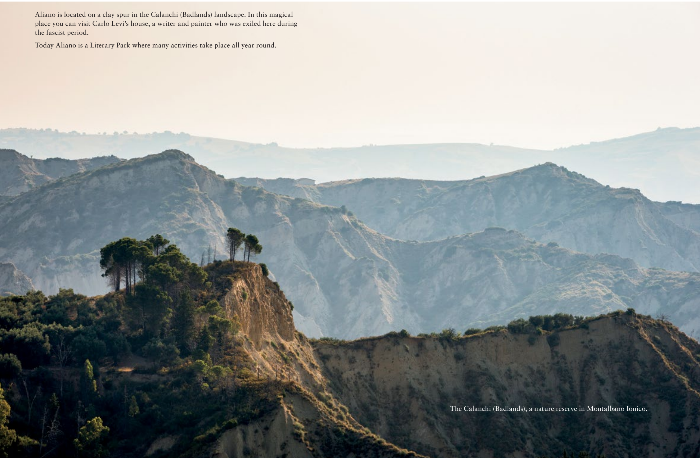
The Calanchi (Badlands), a nature reserve in Montalbano Ionico.